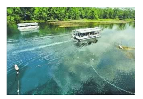
Wakulla Springs State Park 10 miles south of Tallahassee