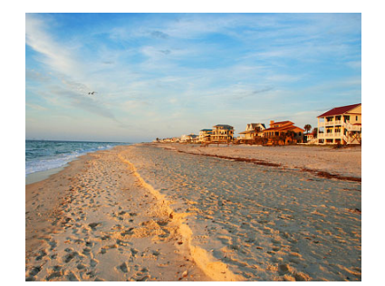
St. George Island Quiet white sand beaches just 1.5 hours away