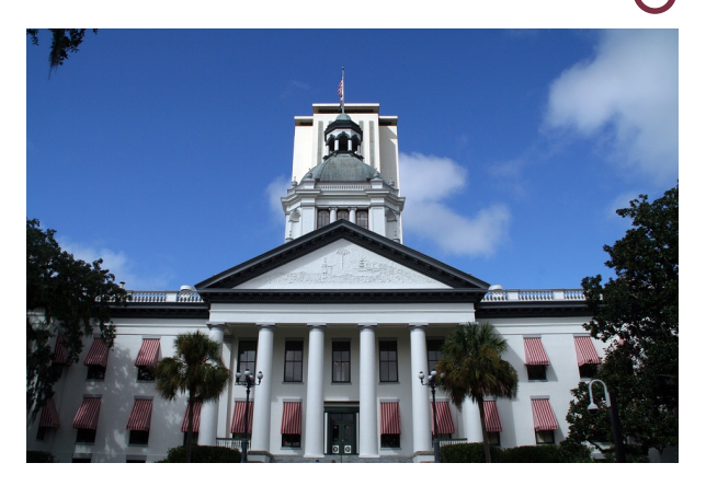
The Old Capitol Building

Tallahassee is home to 122 properties on the National Registry of Historic Places and offers a wide array of cultural experiences like museums, galleries, and historic sites. Both the city and FSU offer a selection of theater and dance productions, art shows, athletic events, recreation venues, and restaurants.