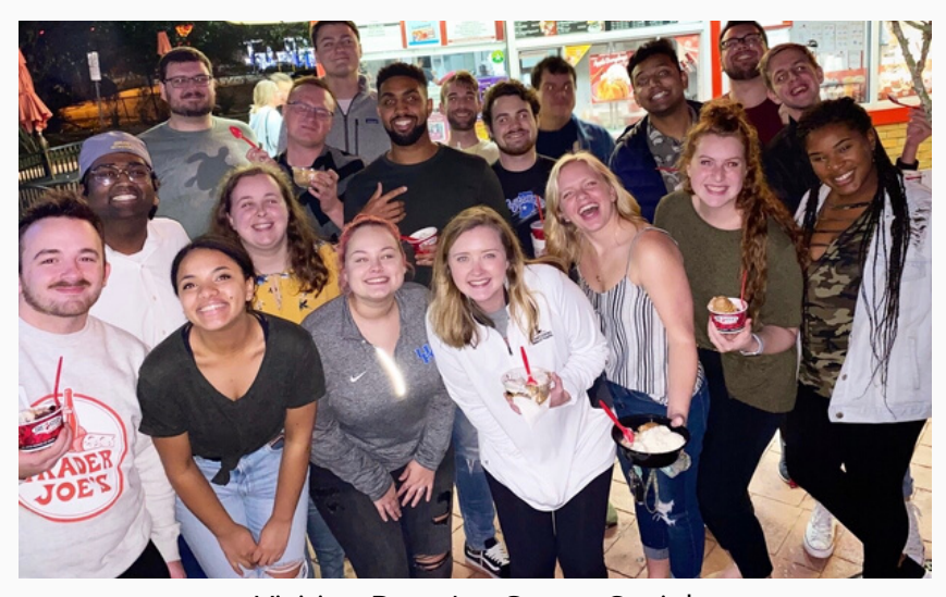
Visiting Days Ice Cream Social

The HESA board represents the voices of graduate students in the Higher Education program at FSU by serving as a liaison between students, faculty, and university constituents. HESA supports the academic progress, professional development, and social integration of all Higher Education students.