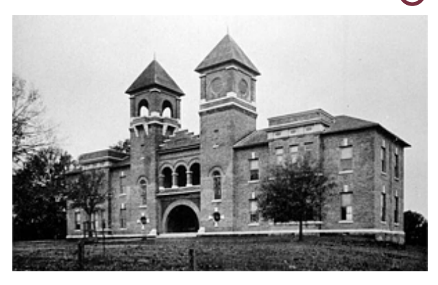
College Hall, circa 1894

In 1823 the Legislature of the Florida territory began making plans for a system of higher education. Florida granted statehood two years later, and with it the federal government granted townships to the new state for the purpose of establishing two institutions of higher learning, with the caveat that one must be east of the Suwannee River, and the other west. In 1851 the state Legislature declared that two seminaries should be established, one for the education of women and the other for men. Tallahassee, in an effort to lure the western institution, established the Florida Institute, believing that the campus could easily be re-purposed.