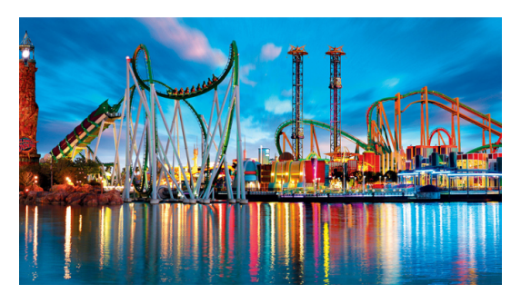
Orlando Disney, Universal, Harry Potter World, all just 4 hours away