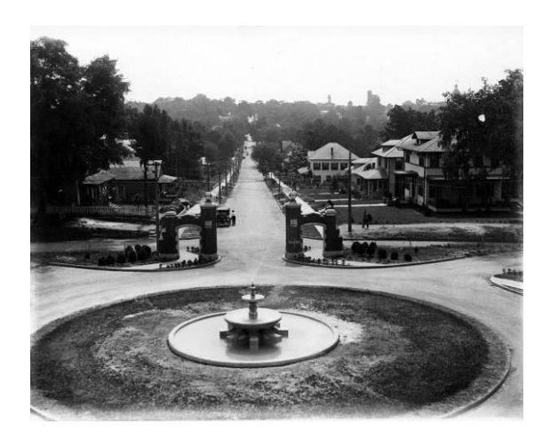
View from Westcott Hall looking down College Avenue, ca. 1920s

In 1905, the state Legislature reorganized its higher education system, consolidating six institutions into two. The University of Florida in Gainesville would serve men and the Florida State College would serve women. In 1909 the college was re-named yet again, this time as the Florida State College for Women.