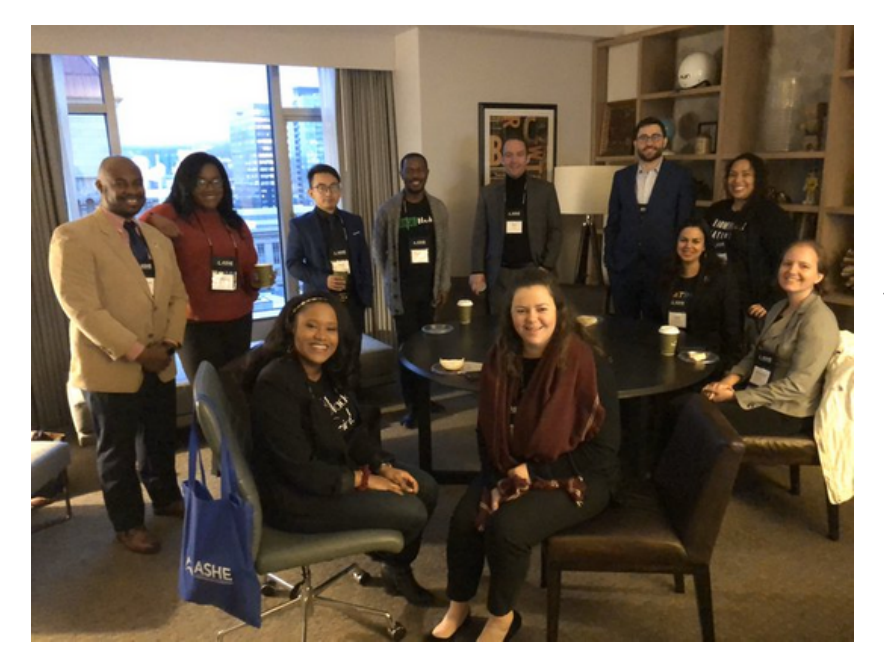
Current and former students and faculty at the 2019 ASHE Conference in Seattle, WA.

Traditionally, we would hold a single, day-long Orientation session. Due to Orientation moving on-line, in response to the COVID situation, we have decided that, instead, we will offer a series of programs for our students to either partake in or watch afterwards.